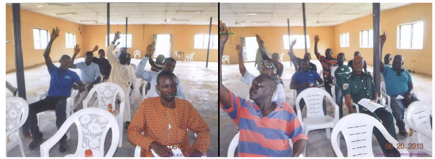
Cross section of participants at the meeting