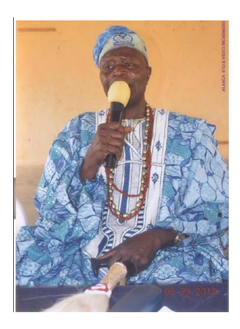
Traditional ruler giving his opening remark