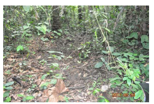
Water path during raining and dry season