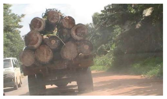
Forest degradation and logging vehicle in action