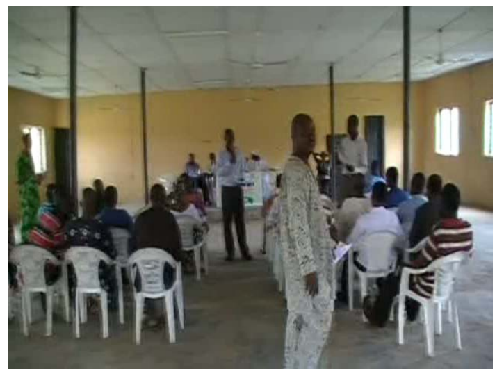
Cross section of audience during discussion on the specific strategies