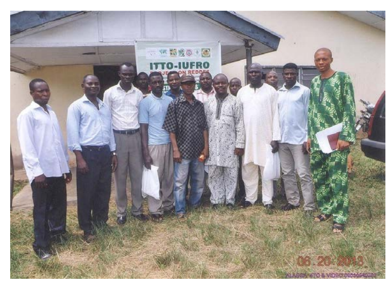
Group picture of participants